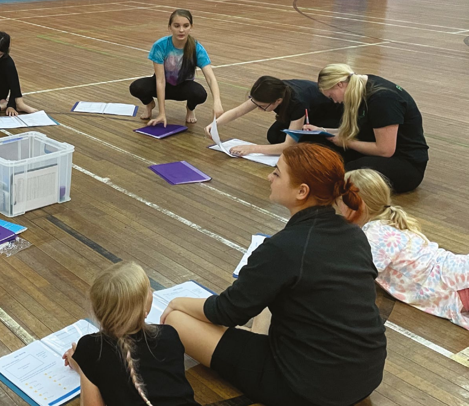
Intensive Project – Arts Award Qualification

“The Arts Award delivery was superb. The activities engaged all the children, and it was accessible to everyone. It brought a real togetherness for the cohort and allowed them to be part of each other’s successes. The positive impact on their mental and general health has been evident.”