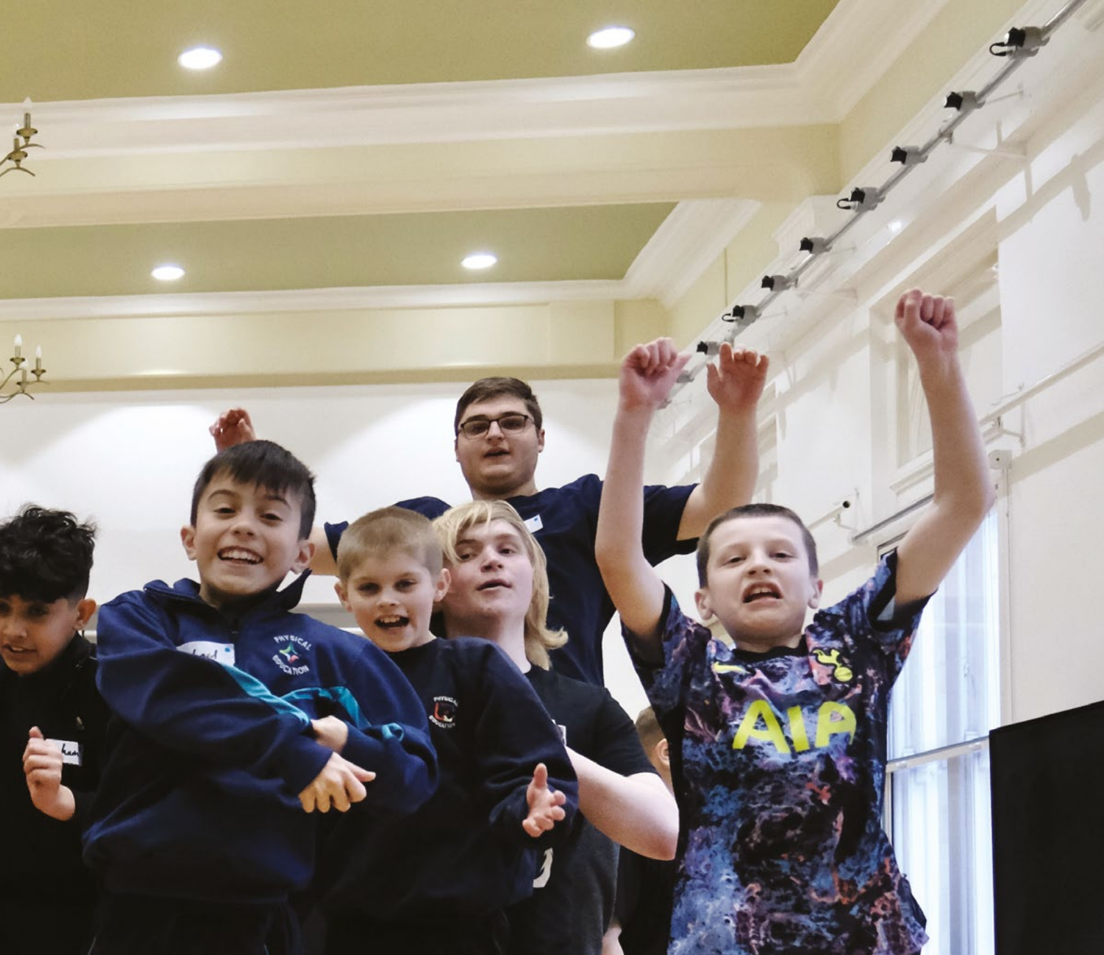
DUXY boys' day of dance

“An amazing experience for students to be active and develop skills away from their desks such as confidence, teamwork, and communication skills. The project helped to break down stereotypes of what dance is and inspire a new generation.”