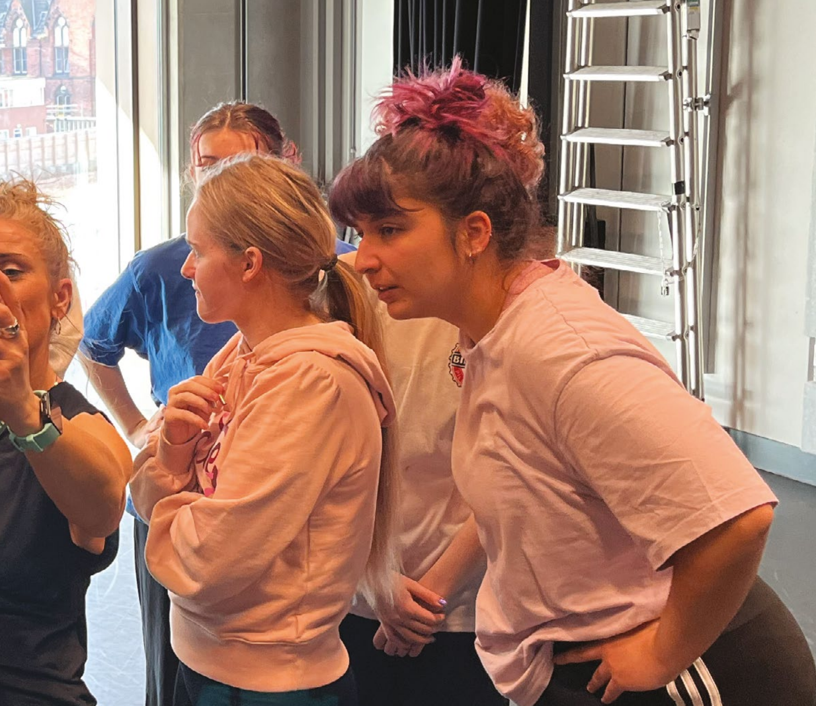
Leeds Beckett Project