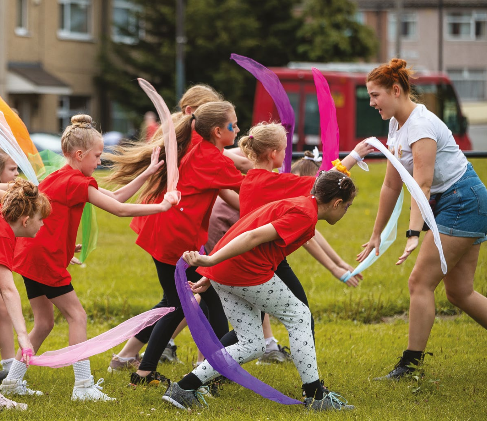
Holme Wood – Hopes and Dreams Festival

“DUY have worked with my daughter to help her understand her self-worth, allowing her to express her emotions and share her angst. Since starting, she has been calmer in school and at home. She can now reflect and identify when her behaviour has not been appropriate and how to prevent it from happening again. I am so grateful for the opportunity they provide for her to learn about herself and her well-being.”