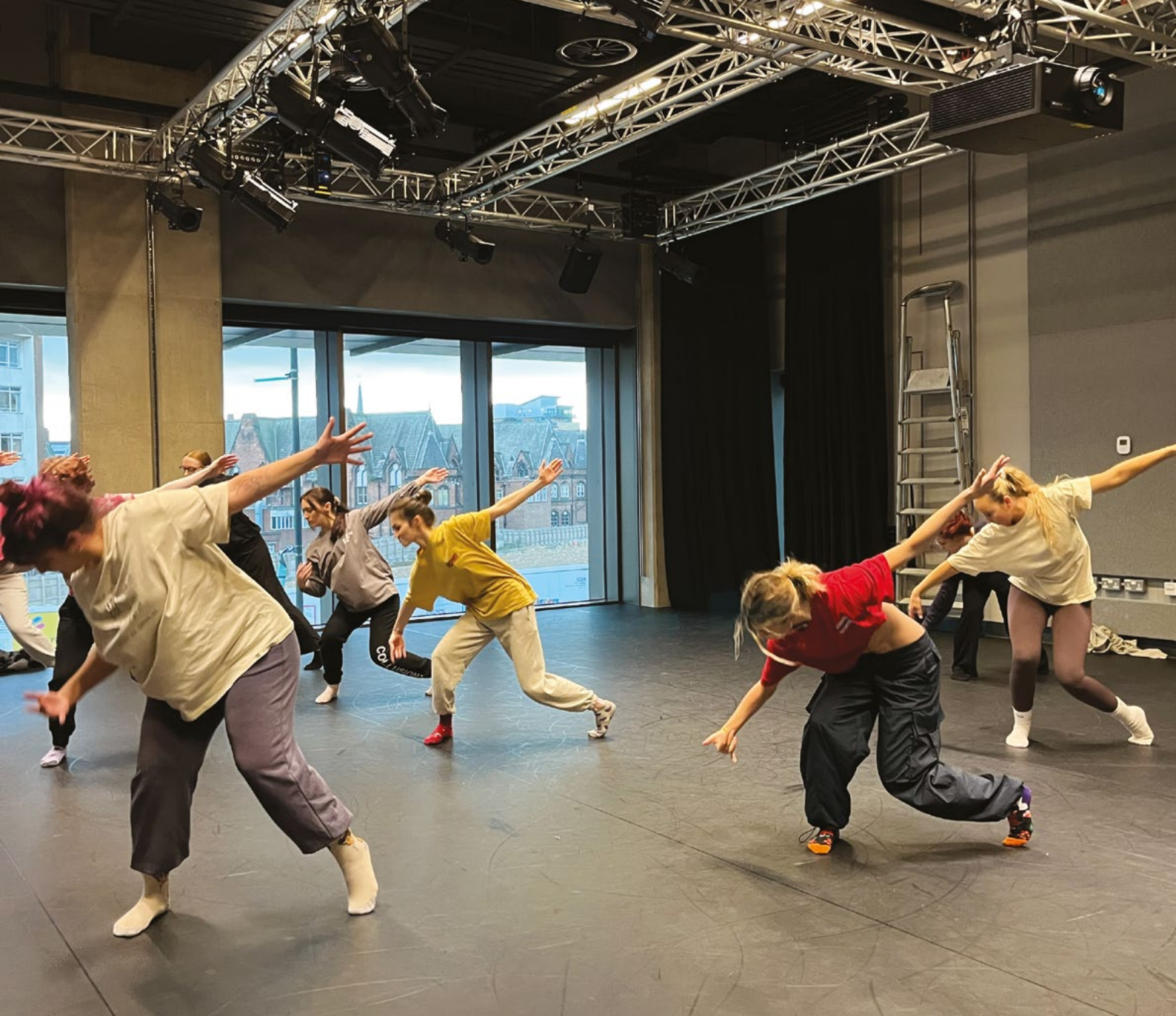
Leeds Beckett Students – Intensive Week