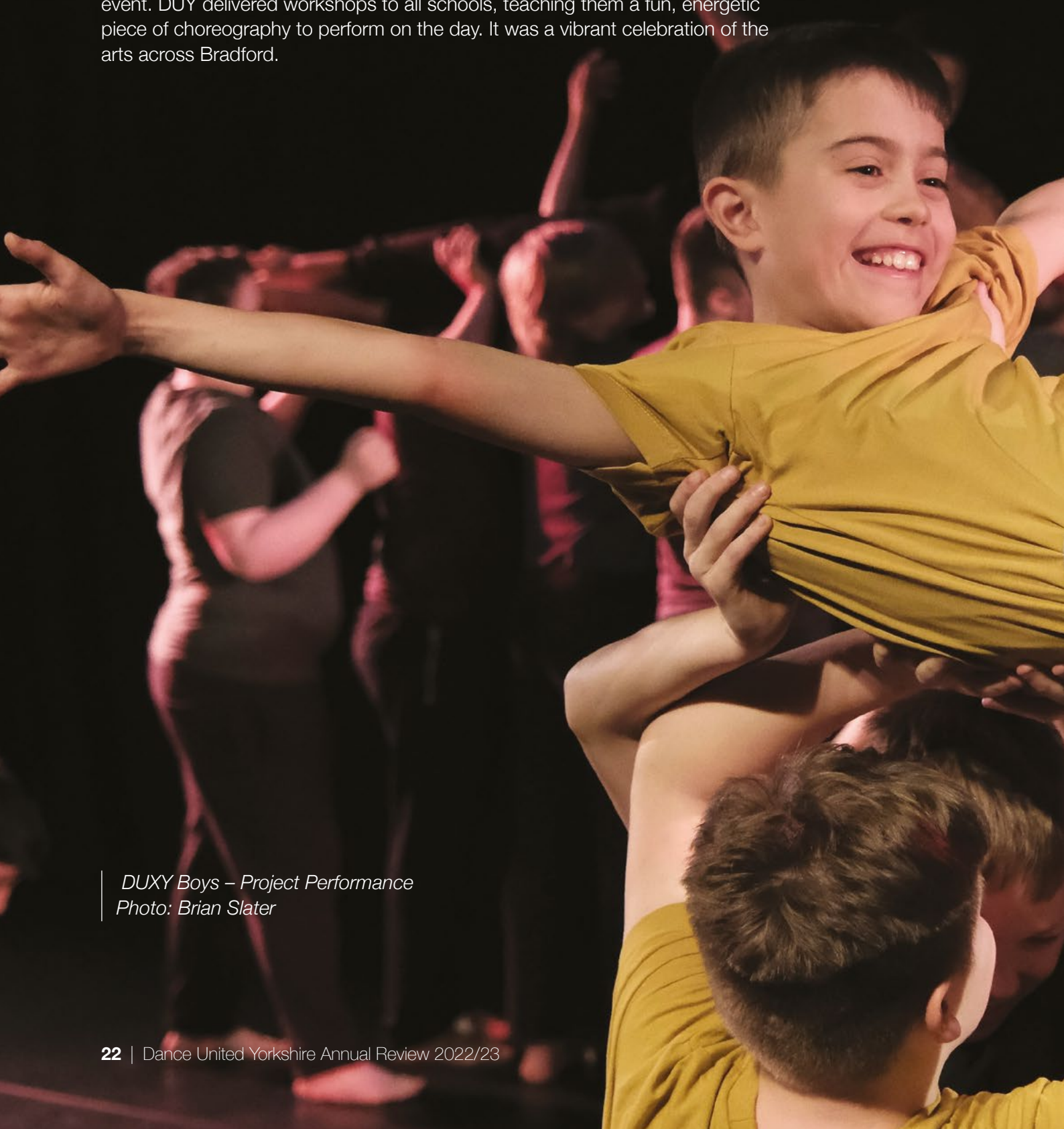
DUXY Boys – Project Performance

We were also part of the Boy 87 event in partnership with 6 Bradford-based primary schools. Boy 87 is a book exploring the refugee crisis, which every year 6 pupil in Bradford is given to read. The event took place at Valley Parade football ground involving poetry, music, and dance. 2,700 year 6 pupils attended the event. DUY delivered workshops to all schools, teaching them a fun, energetic piece of choreography to perform on the day. It was a vibrant celebration of the arts across Bradford.